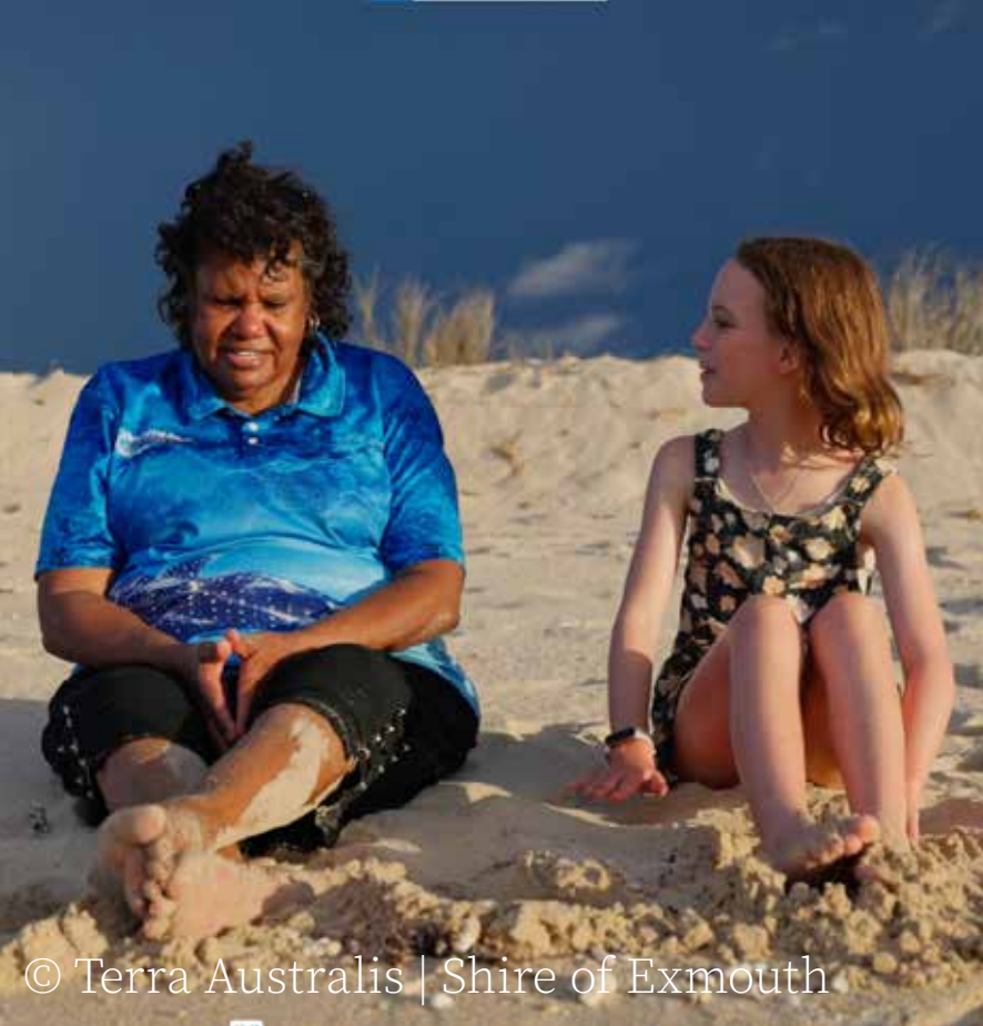
© Terra Australis | Shire of Exmouth