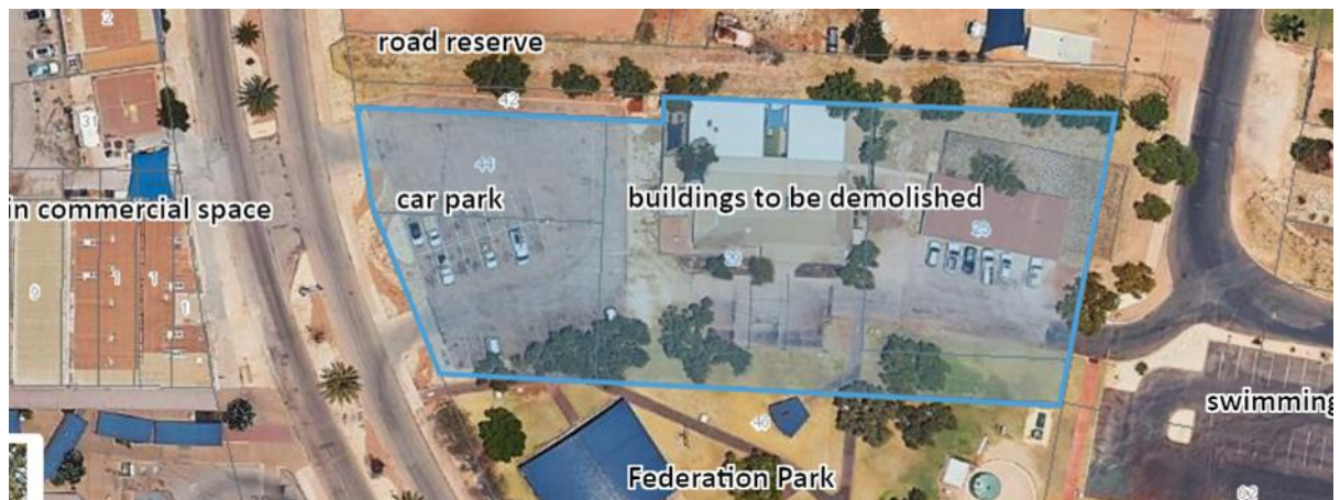
Figure 1. Site Plan area subject of proposed Scheme Amendment No.12.