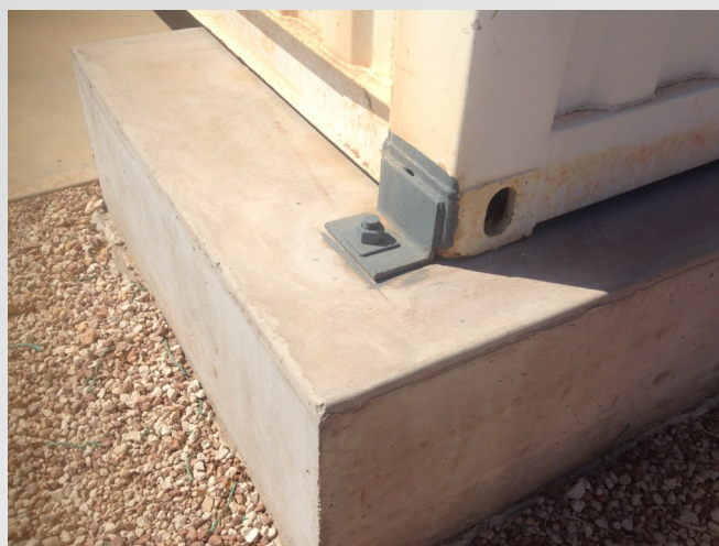
Pictured: A properly secured sea container

"We are asking all residents with sea containers that have not been formally approved to lodge an application as soon as possible," he said.