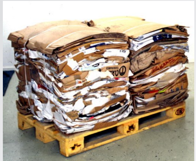
WASTE STREAMS: Cardboard is one of the priority waste streams that could be processed for recycling.

More information on the Shire of Exmouth’s recycling commitment is available by contacting Executive